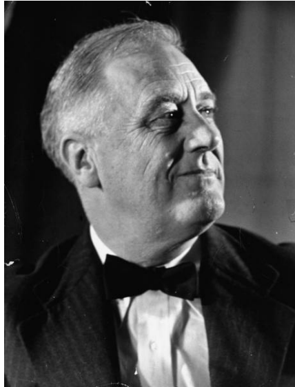
Franklin D. Roosevelt

The Federal Reserve came into being at a time when the United States was doing just fine under a gold standard. Slowly and carefully the Fed lobbied to eliminate the gold standard. In 1933, in the depths of the Great Depression, FDR with the stroke of a pen made it illegal for Americans to own gold except for jewelry and certain collectible coins. He also made the United States Dollar unredeemable in gold, thus creating just one more “fiat” currency.