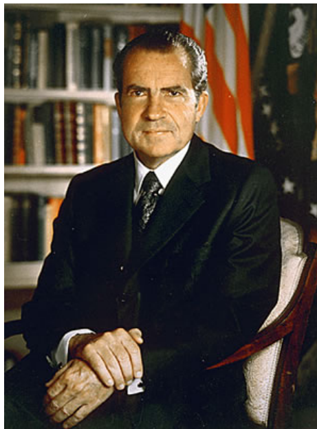
Richard M. Nixon

The Federal Reserve came into being at a time when the United States was doing just fine under a gold standard. Slowly and carefully the Fed lobbied to eliminate the gold standard. In 1933, in the depths of the Great Depression, FDR with the stroke of a pen made it illegal for Americans to own gold except for jewelry and certain collectible coins. He also made the United States Dollar unredeemable in gold, thus creating just one more “fiat” currency.