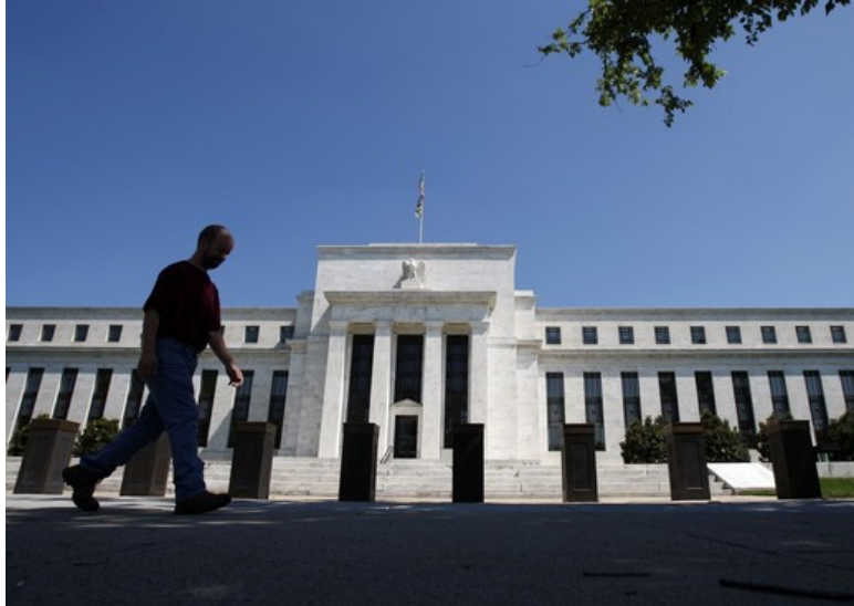
The Washington, DC office of the Federal Reserve

The Federal Reserve is America's third attempt to create a national bank. Right from the beginning Alexander Hamilton pressed to Constitutional Convention to create one, but the Founders knew better.