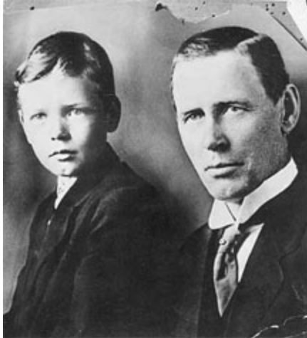
Senator Charles Lindbergh, Sr. with his more famous son

"This Act (the Federal Reserve Act, Dec. 23rd 1913) establishes the most gigantic trust on earth. When the President (Woodrow Wilson) signs the Bill, the invisible government of the Monetary Power will be legalised... The worst legislative crime of the ages is perpetrated by this banking and currency Bill."