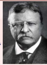
Theodore Roosevelt 26 th President

"It is not the critic who counts; not the man who points out how the strong man stumbles, or where the doer of deeds could have done them better. The credit belongs to the man who is actually in the arena, whose face is marred by dust and sweat and blood, who strives valiantly; who errs and comes short again and again; because there is not effort without error and shortcomings; but who does actually strive to do the deed; who knows the great enthusiasm, the great devotion, who spends himself in a worthy cause, who at the best knows in the end the triumph of high achievement and who at the worst, if he fails, at least he fails while daring greatly. So that his place shall never be with those cold and timid souls who know neither victory nor defeat."